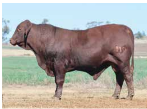
LOT 47 BENELKAY SEAL S110 (PP) SOLD TO COOINDA STUD QLD $9,000