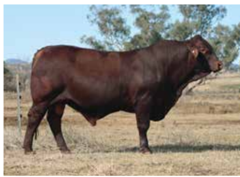
LOT 3 BENELKAY SHORTLIST S006 (PP) SOLD TO STRATHMORE STUD QLD $10,000