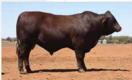
SIRE OF LOTS 10,33,40

Kept for two joining seasons before being sold locally he was used over a select number of cows with outstanding results. Very dark in colour with a fine skin type, exceptional muscling and the bonus he was a homozygous Poll (PP), we felt we could breed some very attractive cattle out of him. Newman has not let us down as can be seen in the bulls on offer within this sale team. Strong carcase attributes that would suite both stud and commercial producers.