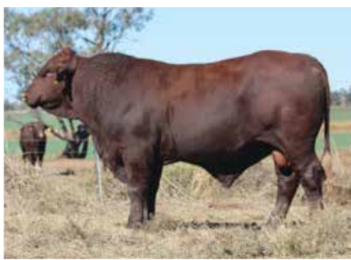
LOT 8 BENELKAY STARDUST S022 (P) SOLD TO OLD BUNDILLA WARREN $9,000