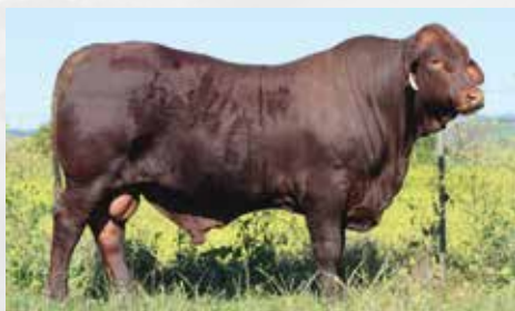
SIRE OF LOTS 9,22,36