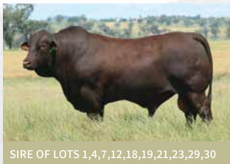
SIRE OF LOTS 1,4,7,12,18,19,21,23,29,30