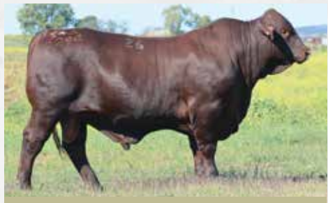
SIRE OF LOTS 6,11,24

Remington was purchased at the 2020 Santa Central sale as a lead bull. We were attracted to him for his strong thickness width over the top line, length and his dark red coat type. His temperament is impeccable and is a pleasure to work with as are his progeny. He was caring strong EMA and IMF what we were after as well as good scrotal size. We are happy with the quality and evenest of his first two drops of calves and believe we will see a lot of his sons in the years to come.