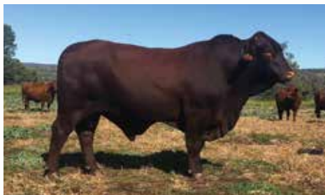
SIRE OF LOTS 2,3,5,8,16