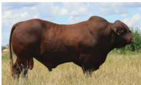
SIRE OF LOTS 13,15,17,25,27,28,32,35,37