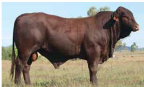
SIRE OF LOTS 31,38