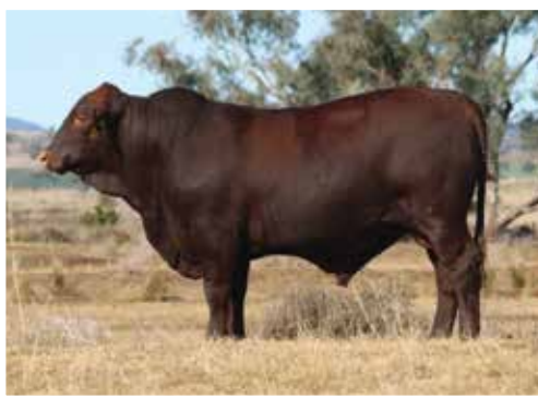
LOT 14 BENELKAY SALVADOR (PP) SOLD TO WALMONA STUD NSW $14,000