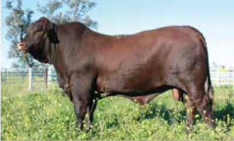
SIRE OF LOTS 14,20